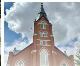
ST. MARY CATHOLIC CHURCH (SM) 528 Broadway St. Piqua 45356 937-773-1327 | piquaparishes.org M-Th, 8:00 a.m.-5:00 p.m. F, 8:00 a.m.-12:00 p.m.