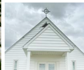
ST. TERESA OF THE INFANT JESUS (ST) 6925 W. US Rt. 36 Covington 45318 937-473-2970 | stteresacovington.org Hours by Appointment