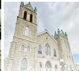
ST. PATRICK CATHOLIC CHURCH (SP) 409 E. Main St. Troy 45373 937-335-2833 | stpatricktroy.org M-Th, 8:30 a.m.-3:00 p.m.