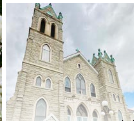
ST. PATRICK CATHOLIC CHURCH (SP) 409 E. Main St. Troy 45373 937-335-2833 | stpatrickroy.org M-Th, 8:30 a.m.-3:00 p.m.