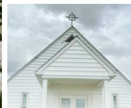
ST. TERESA OF THE INFANT JESUS (ST) 6925 W. US Rt. 36 Covington 45318 937-473-2970 | stteresacovington.org Hours by Appointment