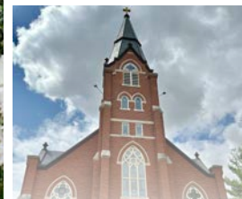
ST. MARY CATHOLIC CHURCH (SM) 528 Broadway St. Piqua 45356 937-773-1327 | piquaparishes.org M-Th, 8:00 a.m.-5:00 p.m. F, 8:00 a.m.-12:00 p.m.