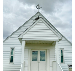
ST. TERESA OF THE INFANT JESUS (ST)