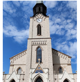
ST. BONIFACE CATHOLIC CHURCH (SB)