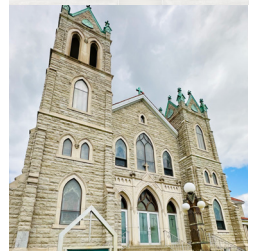
ST. PATRICK CATHOLIC CHURCH (SP)