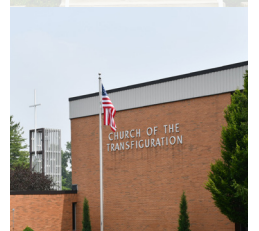
CHURCH OF THE TRANSFIGURATION (TR)