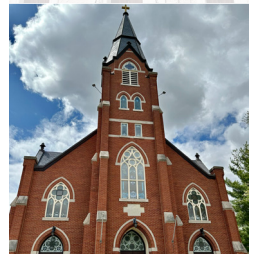
ST. MARY CATHOLIC CHURCH (SM)