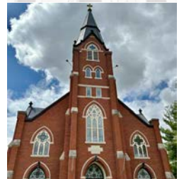
ST. MARY CATHOLIC CHURCH (SM)