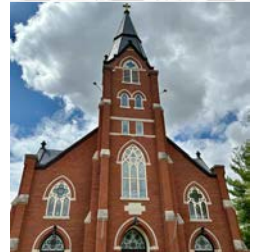
ST. MARY CATHOLIC CHURCH (SM)