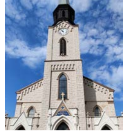
ST. BONIFACE CATHOLIC CHURCH (SB)