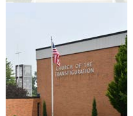
CHURCH OF THE TRANSFIGURATION (TR)