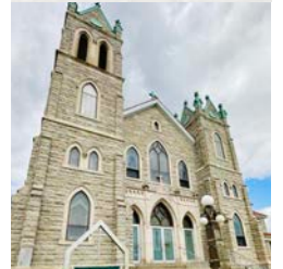
ST. PATRICK CATHOLIC CHURCH (SP)