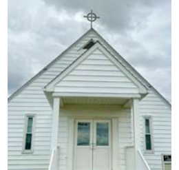
ST. TERESA OF THE INFANT JESUS (ST)