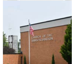
CHURCH OF THE TRANSFIGURATION (TR)