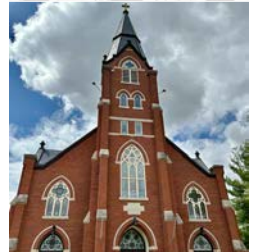
ST. MARY CATHOLIC CHURCH (SM)