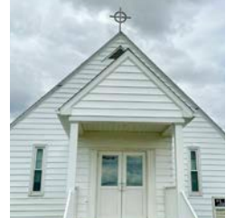
ST. TERESA OF THE INFANT JESUS (ST)