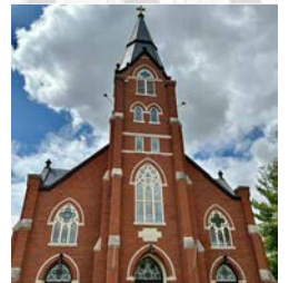
ST. MARY CATHOLIC CHURCH (SM)