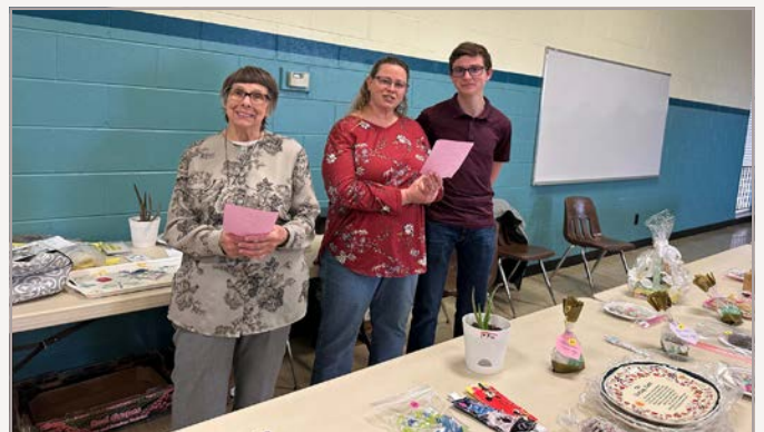
The Palm Sunday Bake & Craft Sale hosted by the Altar Rosary Society made $623.70! Thank you.