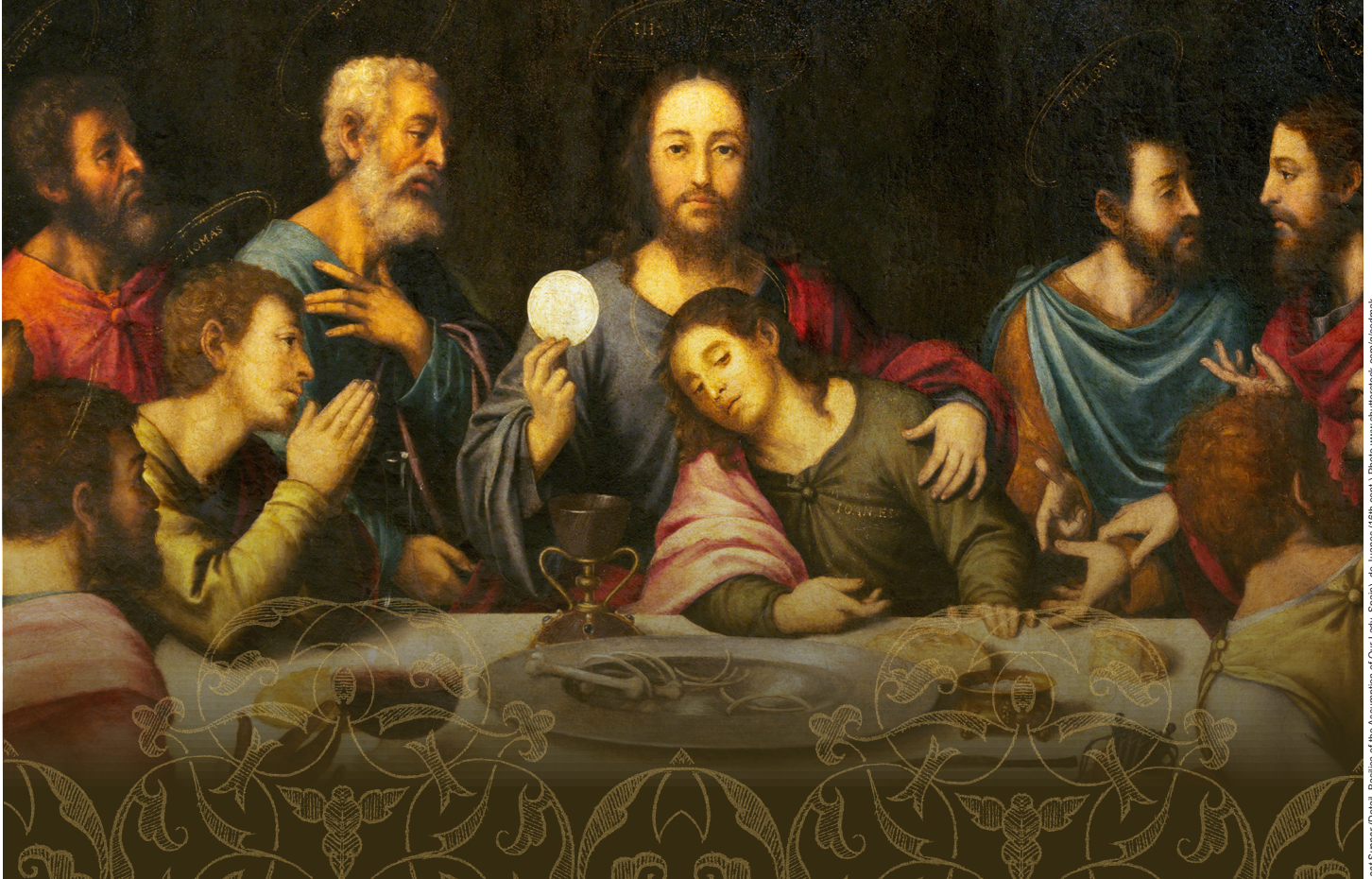
Last Supper (Detail, Basilica of the Assumption of Our Lady, Spain), de Juanes (16th cent.)

Whoever eats my flesh and drinks my blood remains in me and I in him. – John 6:56