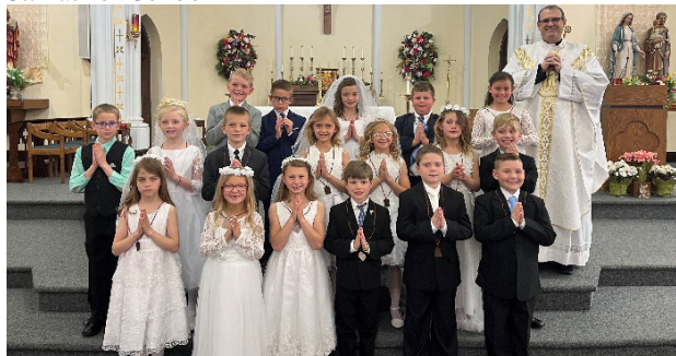
St. Patrick CCD