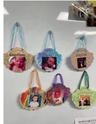
Our DD class learned about how we become a part of God's Family at Baptism.