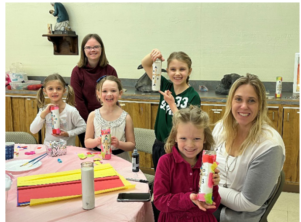
The Little Flowers made their own prayer candles.

Totus Tuus for grades 1-12 will be held on June 18-23.