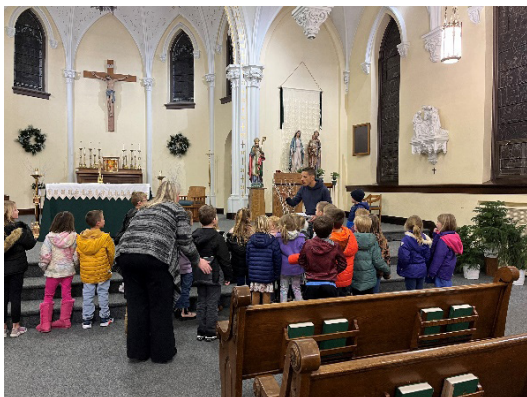
The CCD Kindergarten and First Grade class had a special church tour.